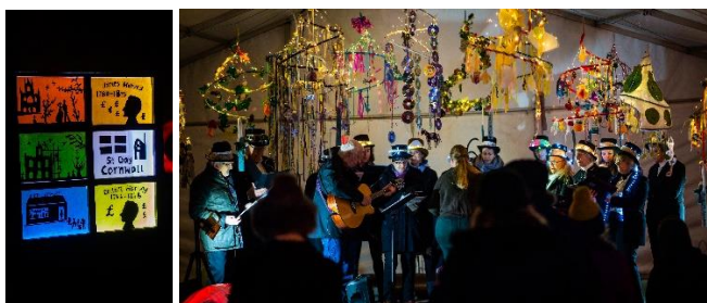
Images of the Signs and Wonders spectacular