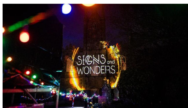
The Signs and Wonders DiaspAURA community event