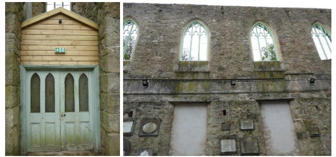
Internal vestibule elevation with existing doors to be re-painted

07 February – initial works to provide a secure and weatherproof 'inner vestibule' completed. it was decided to delay the works to refurbish the former vestry until April.