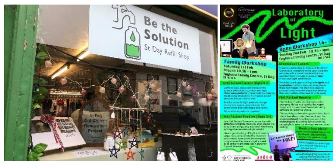
Local Store supporting the Project

has been provided at the owner's request. Donation boxes were also placed in St Day General Stores and the Post Office.