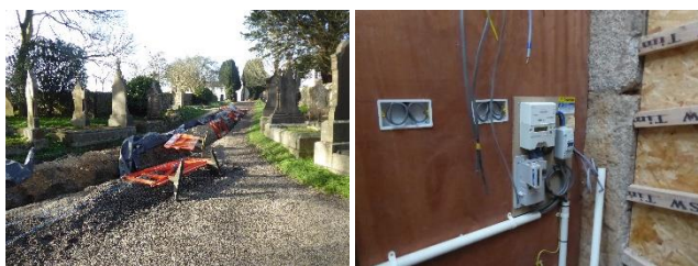
Trench for electricity supply

05 February – the electricity supply to the building was completed and tested.